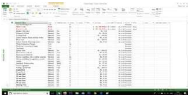
Fig – 4 resource sheet

When the linking portion of the activities is completed resource sheet is generated in excel sheet which includes the labor charge the material such as cement, bricks, tiles, course aggregate, fine aggregate, CP fittings, the material regarding the mobilization, material for watchman cabin etc. the rates according to the current states in the market are mentioned in these resource sheet labor charges are also included as per the current states. Ones the resource sheet is generated according to the material, human resource and their requirements which is derived according to the requirements mentioned in the BBS (bar bending schedule).then the resource sheet is imported in the MSP software and each of the activity is allocated with the resources.