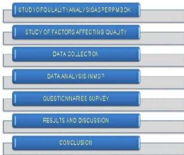
Fig – 2 methodology of the project